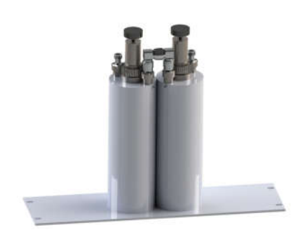
Optional 4 RU rack mounting kit

BEXT Inc. 1045 Tenth Avenue San Diego CA 92101 USA • Tel 619 2398462 • www.bext.com • e-mail: bext@bext.com