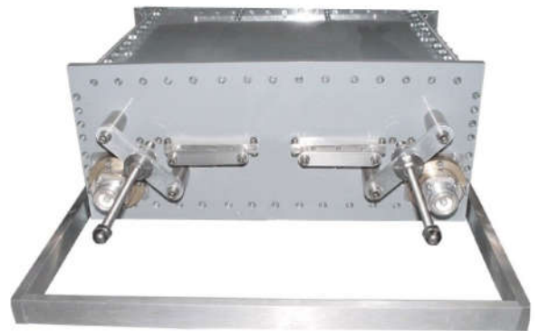
Optional 4RU Rack Mounting Kit Shown