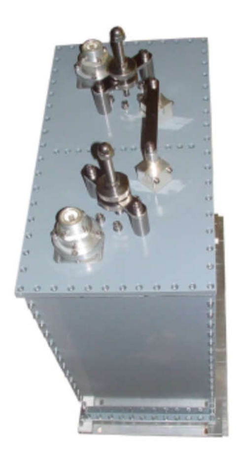
Optional 6RU Rack Mounting Panel Shown